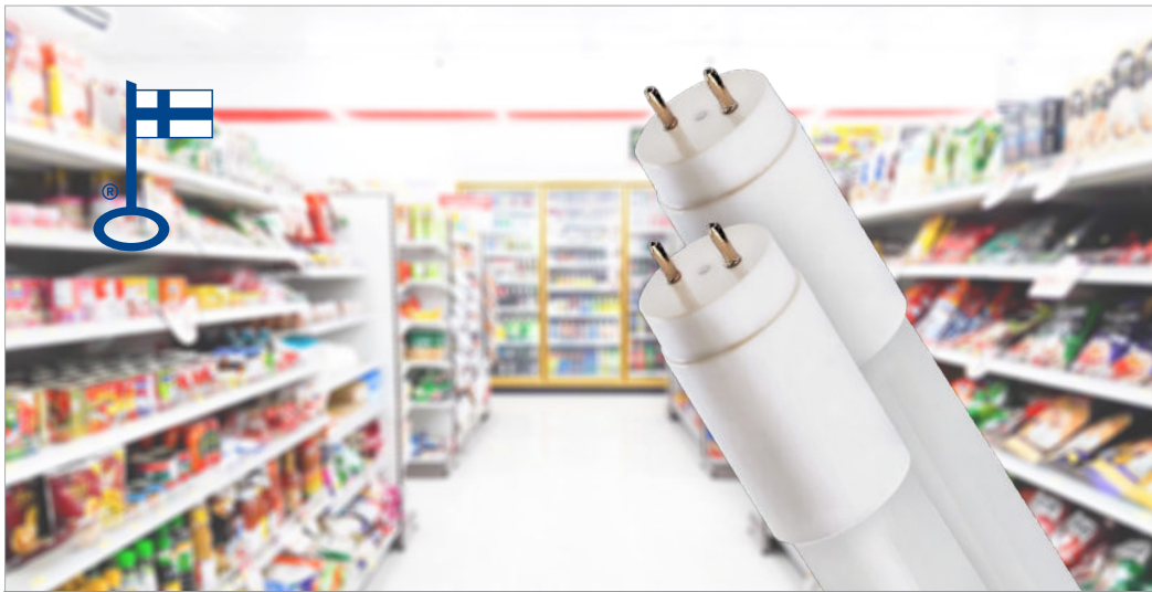
Valtavalo E4 generates flicker-free, high quality, white light and imitates perfectly the conventional fluorescent tube.

The E4 LED tube, the latest addition to the Valtavalo® E series, provides flicker-free light with high efficiency. It offers a top performance and cost-effective solution for applications in general operating conditions, for example, in offices and other standard business facilities. Its shatterproof glass frame also makes it ideal in locations where the breakage of a light cannot interfere with the use of space. Due to its 64,000 hr lifetime and competitive pricing it offers great value for money and ensures short return on investment.